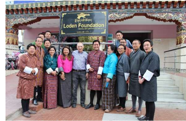
The Loden Team