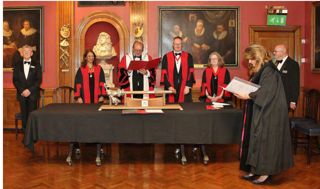
The opening of a Ceremony Court Meeting

If, at any stage, you have questions or suggestions, please contact any Member of the relevant Committee.